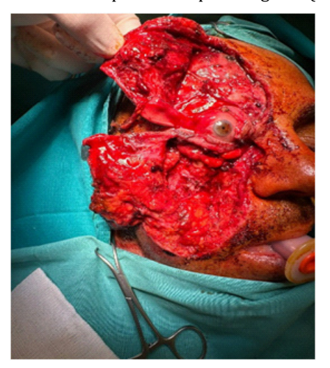
Fig 3. After Debridement

We found intraoperatively avulsion of right frontal muscle, corrugator, orbicularis and procerus. We found also avulsion of upper and lower lids with soft tissue defects, avulsion of the right eyebrow, avulsion of zygomaticus major, minor, risorius, buccinator, levator labi superioris and levator labi superioriset aleque nasi muscles. We also found the partial avulsion of the zygomatic and buccal branches of the facial nerve and the anterior part of the parotid gland (Fig.3).