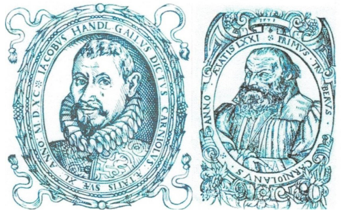
ILL.-2. Jacobus Handl Gallus (1550-1591) and Primož Trubar (1508-1586)