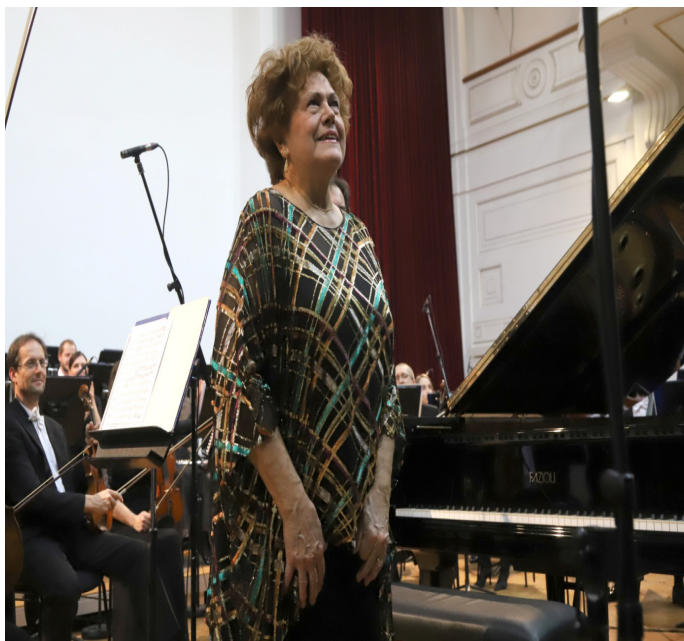
ILL.-6a. The pianist Dubravka Tomšič Srebotnjak, Slovenia (2020)