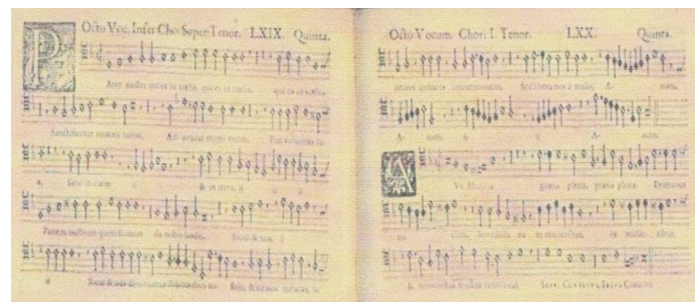
ILL.-3. Gallus 's Opus musicum numquator, quinque, sex, octo et numpluriumvorum ...

(Prague/Czech, 1586), the part of tenor voice; the 1st page)