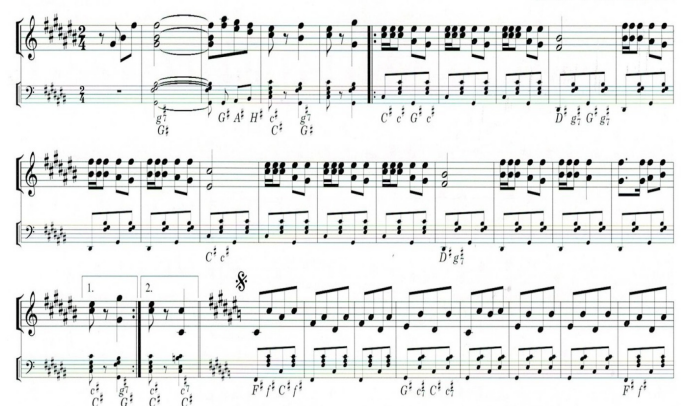
ILL.-5. V. & S. Avsenik, Na Golici (polka; the beginning)