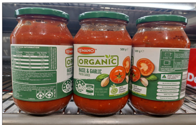
Figure 3. Provenance-washed product: Organic product with ACO (Australian Certified Organic) certification and “Made in Australia from imported ingredients”thereby suppressing the geo-provenance under the rubric of “imported”.

The possibility of provenance-washing, can be a temptation to substitute an organic ingredient from a cheaper source for a locally sourced product. This may advantage the import of organic certified produce from China (when and if it is cheaper). The practice of provenance-washing circumvents the intent of Country of Origin Labelling (CoOL) and dis-informs customers under such cryptic rubrics as “imported” and “Non-EU”(e.g Fig.3).